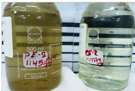
Jet fuel Upstream of filtration

Depollution of the Jet fuel was successfully achieved in a single pass of the 2 micron “absolute” rated particulate filters and Aquasep® XS liquid/liquid coalescer cartridges. Unlike conventional glass fiber coalescer filter elements, the polymeric media used in Pall Aquasep XS coalescers effectively prevents disarming (i.e. inability to coalesce and separate water), ensuring long service life and delivering consistently ‘clear and bright’ jet fuel downstream.