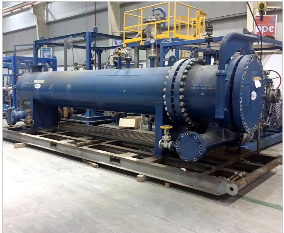
One of two Pall Ultipleat High Flow solid particulate skids