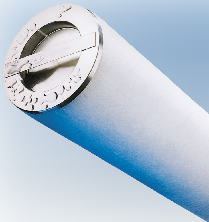
Pall SepraSol Plus liquid/gas coalescer

One major reason why coalescers do not function properly in the field is because of an underestimation of the liquid influent concentration to the coalescer. Simply stated, the more liquid charged to a coalescer system, the more coalescer media required. If the coalescer is challenged with too much liquid, significant quantities of liquid will become re-entrained in the effluent gas, and downstream equipment problems will continue to occur.