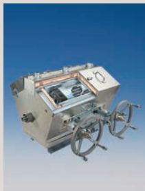
CPF System® Polymer Filter Candle System

Coating: Pall Poly-Fine® filter cartridges were installed for consistent and cost-effective particle removal in low viscosity fluid applications