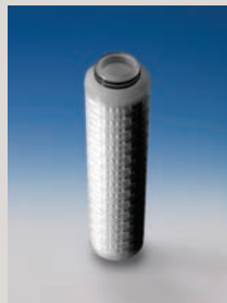
Pall Poly-Fine® Filters