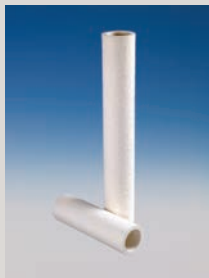
Pall Profile® A/S Filters