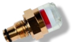
Mechanical \Delta P Indicator