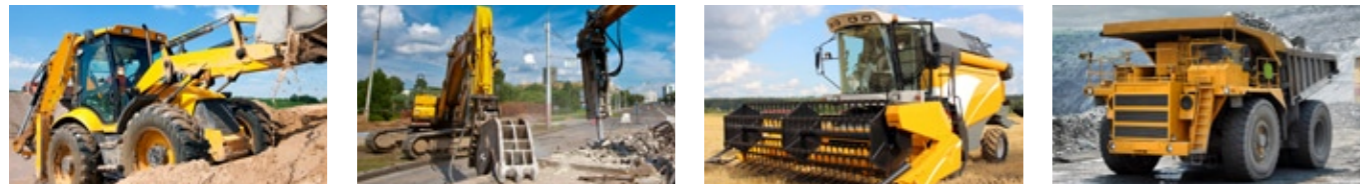
Maximum protection for mobile equipment