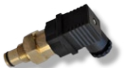
Electrical \Delta P Indicator