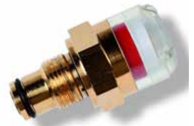
Pall RCA219 differential pressure indicator