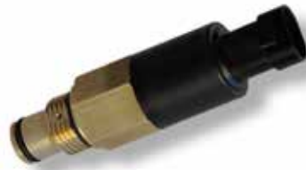
Pall RCA217 differential pressure switch