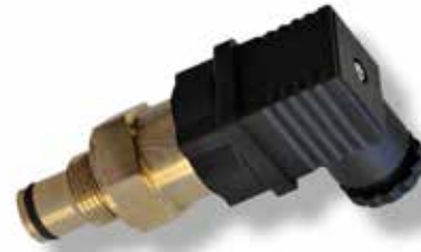
Pall RCA218M differential pressure indicator