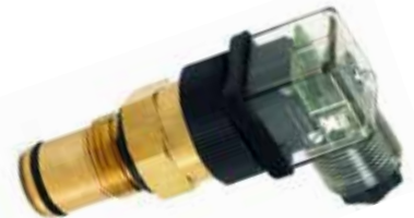
Pall RCA218R differential pressure indicator