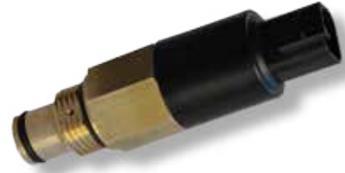
Pall RCA216 differential pressure switch