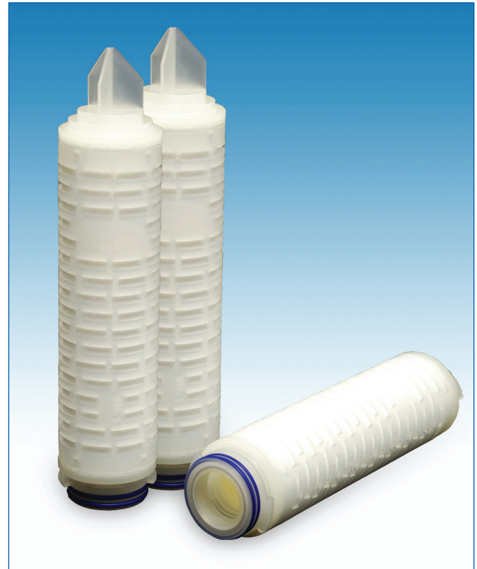
PREcart PP II Filter Cartridges

Please refer to the Pall website http://www.pall.com/foodandbev for a Declaration of Compliance to specific National Legislation and/or Regional Regulatory requirements for food contact use.