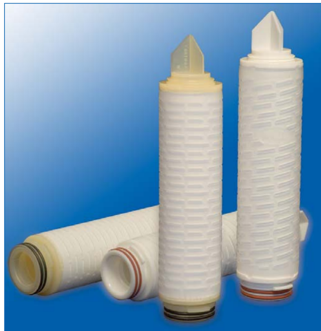
Ultipor N66 filter cartridges with nylon and polyester hardware