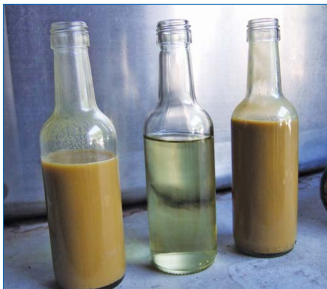
Oenoflow HS must lees samples (left: feed, middle: filtrate, right: concentrate)