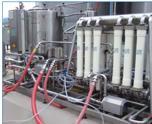
A 12-module Oenoflow HS-A system, Pall's new technology for lees filtration