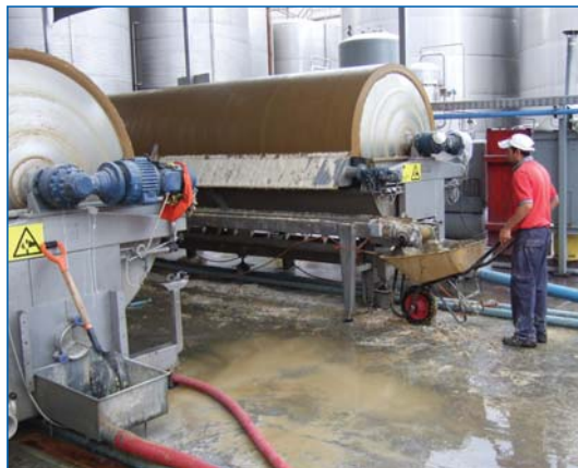
A rotary vacuum drum filter (RVD), the traditional method for recovering wine and juice from lees

One of the biggest benefits that wineries realize by implementing the Oenoflow HS system is improved