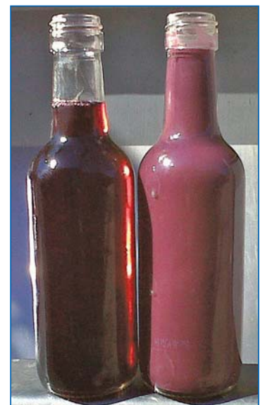
Oenoflow HS wine lees samples (left: filtrate, right: concentrate)