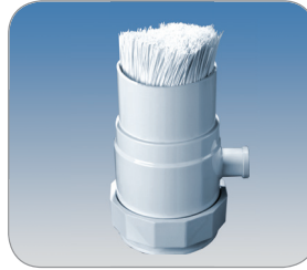
Hollow Fiber filters