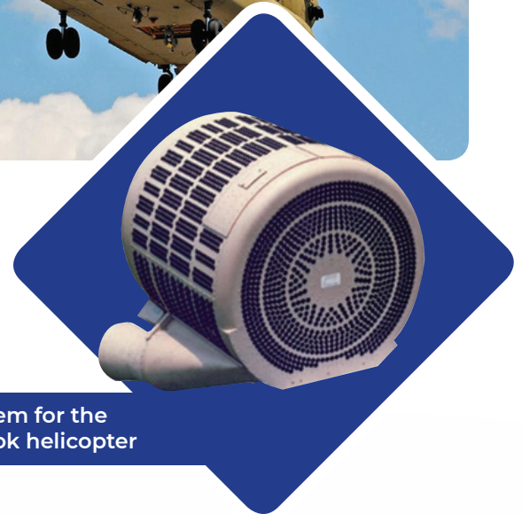
PUREair system for the CH-47 Chinook helicopter